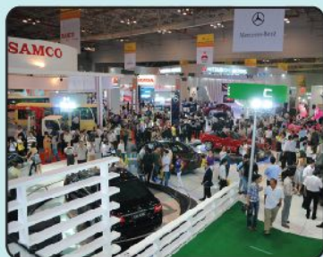
VIETNAM MOTOR SHOW 2010