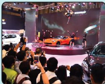
VIETNAM MOTOR SHOW 2011