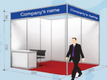
Standard booth (3mL x 3mW x 2.5mH)