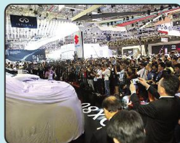
VIETNAM MOTOR SHOW 2016