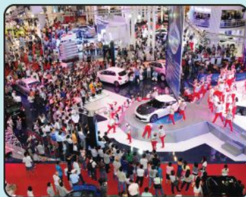
VIETNAM MOTOR SHOW 2015